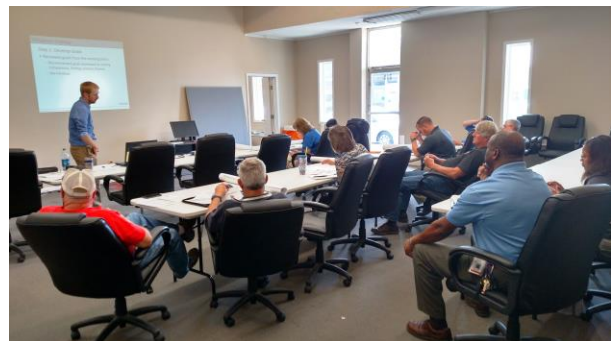
October 8, 2015 MEMA District 6 RHMC Meeting