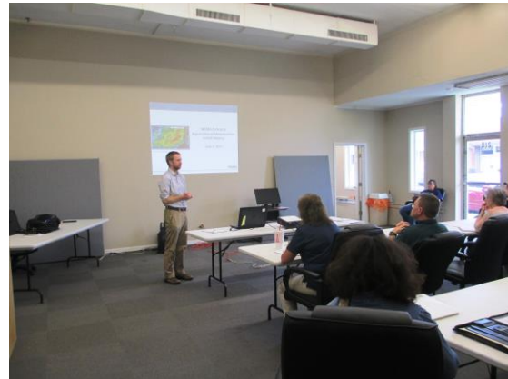
June 9, 2015 MEMA District 6 RHMC Meeting

Following the contractual Notice to Proceed, Atkins staff arranged for a project kickoff meeting. The MEMA District 6 Area Coordinator helped to arrange a meeting location. An email was distributed which invited representatives from the participating counties and municipalities, external stakeholders, and other local organizations to the meeting. The regional participants are collectively known as the Regional Hazard Mitigation Council (“RHMC” or “Council”). The meeting was held at the Scott County Emergency Management Office and was attended by a range of stakeholders.